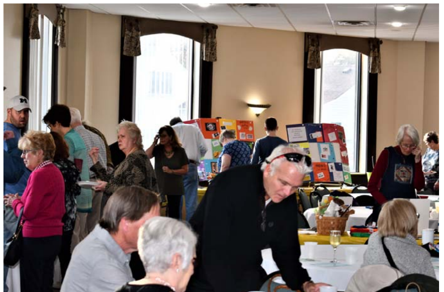
Guests at our 2019 Soiree/Fundraiser having a great time

Greater Royal Oak Democratic Club Japhet School Michigan Schools and Government Credit Union Miner's Den Royal Oak Chamber of Commerce Royal Oak Garden Club Royal Oak Historical Society