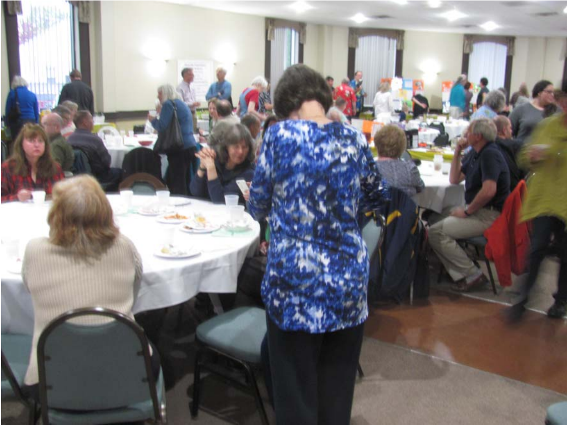
Photo of goings-on at the Nature Society's 12 th Annual Fundraiser

Please check out our Facebook page & "like" the Royal Oak Nature Society.