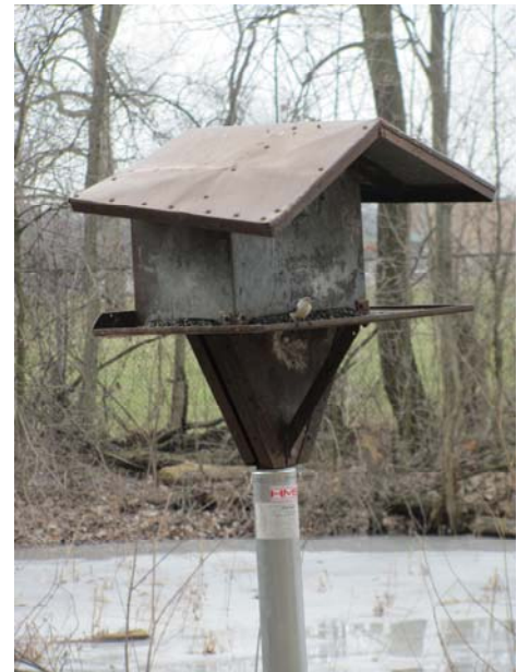
Nuthatch at the Tenhave birdfeeder

want one to crush a planted tree. We removed three live Silver Maples from the Oak Savanna planting in April. These were left on the edge during the initial clearing in 2007 so the field would not appear bare. They were producing too much shade so they needed to be removed. Pin Oaks that are less dense and part of the Oak Savanna ecotype we are recreating will replace these maples.