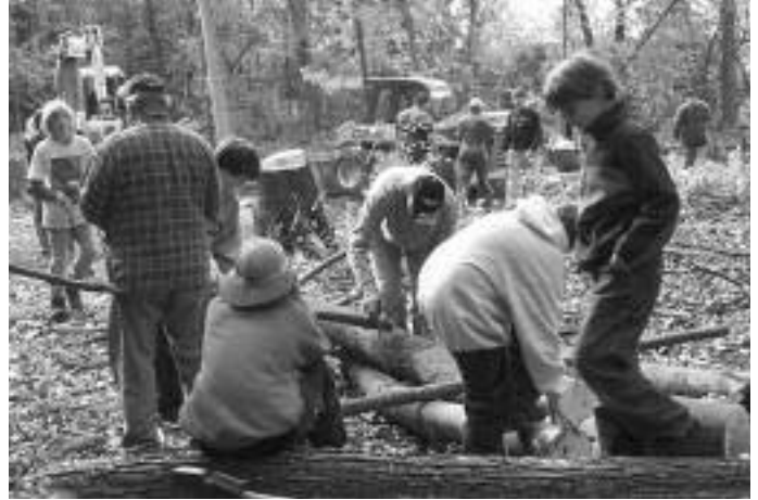
On October 22, a work crew consisting of scouts, school children, parents, a professional excavator and volunteers from all walks of life helped out in the clearing of trees and scrub. Their hard work is greatly appreciated.