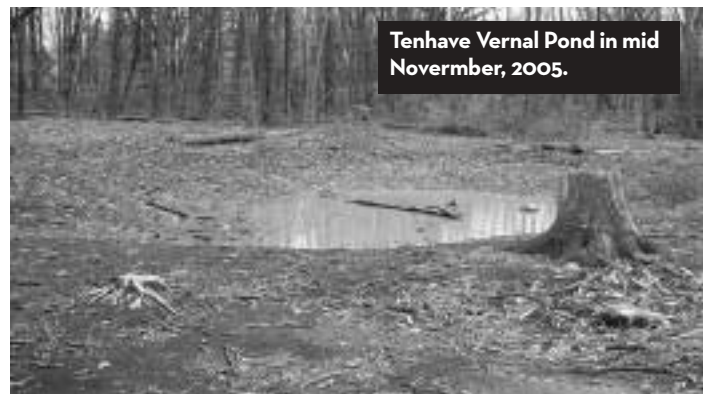
Tenhave Vernal Pond in mid November, 2005.

I hope that in a few years we can have small children come to the pond to learn