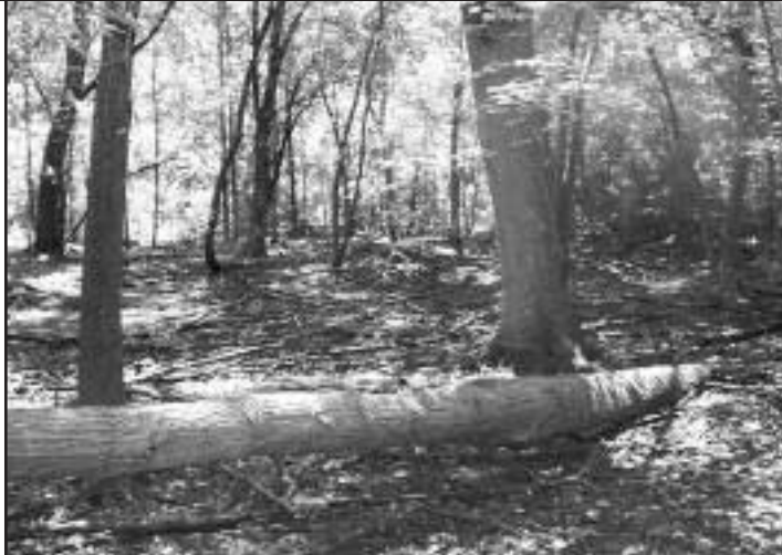
Thirty years of tree growth turns a once sunny pond into a hidden forest pond. The Tenhave Vernal Pond photographed in July 2005.

That night at dinner it was all I could talk about. My father told me that he caught them when he was a boy; he seemed to know everything about them. After dinner he looked at me and asked if I would like to catch one. "Yes, of course" was my answer. We went into the woods at Campbell and Gardenia, only a few blocks from my home. I can still clearly see the small pond in a clearing in the woods. It was maybe 40 by 20 feet, had a large fallen tree across it and the water was shallow and clear. Looking down into the water after a few minutes, I noticed a little inch long crawfish. I was shown how to make them scoot backwards into my hand and within a few minutes I had caught one. For the next few years, I spent lots of time there catching toads, frogs, pollywogs, crawfish, dragonfly larva and all kinds of small water creatures. That was fifty years ago and I have never lost the wonder of catching and learning about what lives in ponds, streams and lakes. In those same fifty years, Royal Oak has grown; the many wild, undeveloped corners of the city are gone. Now the vernal ponds that once dotted the city are the rarest wildlife habitats we have. Little boys no longer have the chance to capture