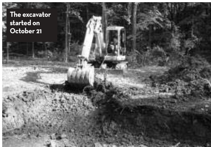
The excavator started on October 21

also helped with a deal on a stump grinder. We also began to look for volunteers; there would be plenty of work for them to do. At that point, we were off and