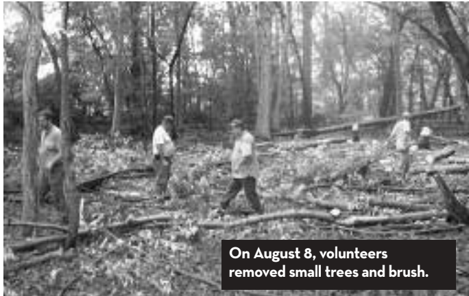
On August 8, volunteers removed small trees and brush.