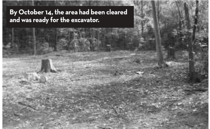
By October 14, the area had been cleared and was ready for the excavator.

sediment that had filled the pond up in the last few decades. The wind creates ripples that increase the surface area and thus increases the ability of the water to absorb oxygen.