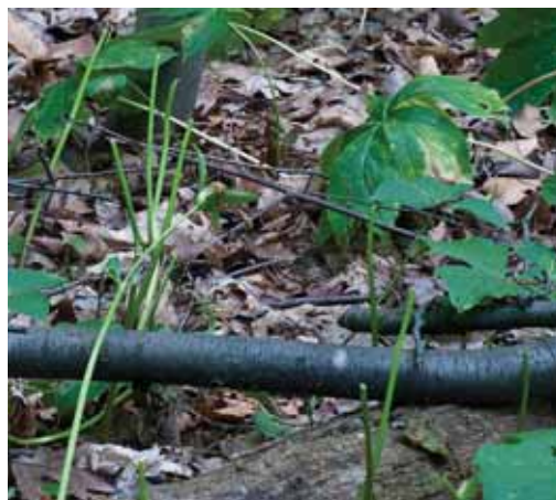
Browsed trillium in Tenhave

We are proposing to repair the main fence (in the area where there are no houses) and raise the shorter fence along the section of the park where there are adjoining houses. We want to cage the park to keep out the