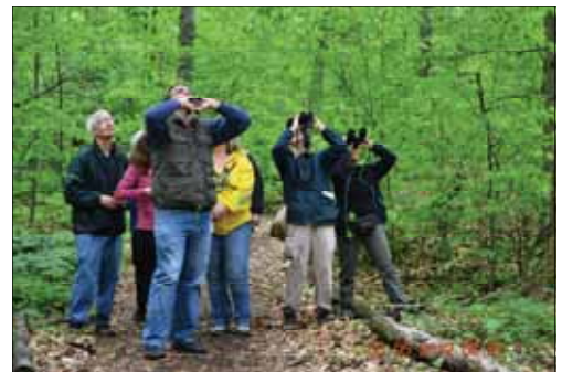
Looking up in the trees for birds

Dragonfly Pond. Viewing trays were available to examine and identify what was found. Clam Shrimp, Crawfish, Spring