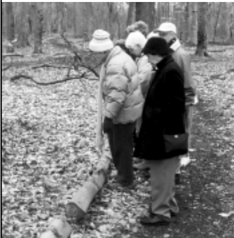
Seniors enjoy a nature walk through Tenhave Woods back in April.

it's Cummingston's turn. Our main efforts now will be to bring Cummingston up to par with Tenhave Woods. The flooding has destroyed well over 90% of the park's wildflowers, but there is hope. This spring I found several large clumps of trilliums and last spring we found bloodroot, not seen in the park in 25 years. If we