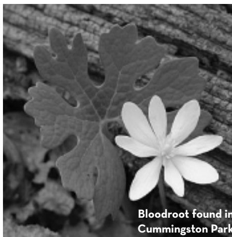
Bloodroot found in Cummington Park

Why the change? Well-marked and maintained trails. This alone makes the park look inviting. It becomes very noticeable in the winter that the trails are being used; all of the foot traffic packs the snow down on them. Eagle Scout projects have helped in the building of the new trails and a new program, Boy Scout Stewardship, assists in maintaining them. All of the major trail