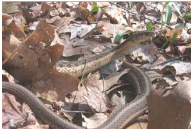
A garter snake seen near one of the Tenhave trails

tion might increase. This year it seemed like we didn't have any deer in Tenhave. This is a very good sign as the woods are simply not large enough to support a population of deer without the loss of our wildflowers. Wood Ducks were seen nesting and raising a family inside Tenhave.