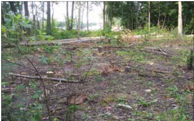
Arboretum area after buckthorn trees were removed

The Botanical Garden/Arboretum we started behind the Senior/Community Center is slowly moving forward. We have cut out a large area of buckthorn and have begun limited planting. As with our ponds, the cleared area behind the Center had many plants in the seed base that had not been seen there for years. Blue Lobelia and Cardinal Flower are among many of the other wildflowers that showed up. Hopefully, this area will finish being cleared by next summer (2010) and we can begin to attract gardeners to help to plant and maintain the arboretum.